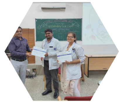
Distribution of Certificates 3rd Prize Winners