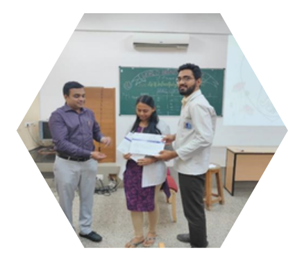
Distribution of Certificates 2nd Prize Winners