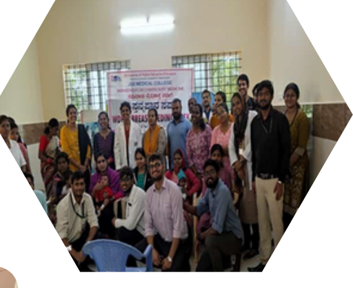
One to one discussion on breastfeeding with lactating mothers.