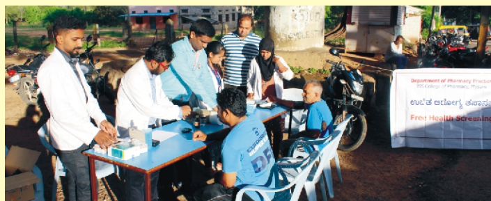
Health screening camp at Lalith Mahal Palace Gate

Department of Clinical Pharmacy organized Health Screening Camps in multiple places for the benefit of public of Mysuru City on 21 st September 2017 and 10 th October 2017. During the camp, blood glucose testing and blood pressure measurement were carried out with the aim of sensitizing the general public about the importance of undergoing regular health checkup to detect the chronic diseases such as Diabetes and Hypertension at the early stages for the better control.