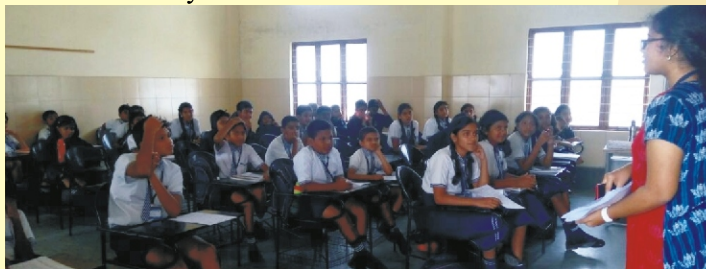
During the outreach program

Many of the students and teachers actively participated in the question and answer session following each of the education session to clarify their doubts.