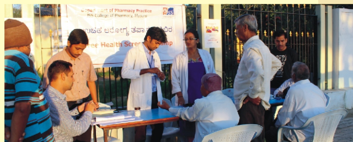
Health screening camp at Balbhavan

A total of 631 people were monitored for their blood pressure and blood glucose levels. All those people who were identified with elevated levels of blood pressure and blood glucose levels were advised on non-Pharmacological management and suggested to consult a physician for further screening and management. First year students of postgraduate Pharmacy Practice and Pharm.D interns were actively participated in the health screening camps and provided counseling services.