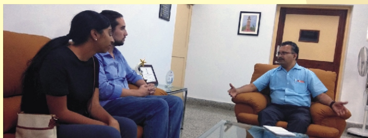
UNC Students with the Principal, JSSCP, Mysuru

Institute of Oncology for a period of one week to learn about various opportunistic infections associated with HIV and Cancer management, respectively. Towards the end of their clinical rotation, they were posted for a week at Govt. Head Quarters Hospital, Ooty which is a practice site of JSS College of Pharmacy, Ooty to provide them an opportunity to understand the healthcare delivery system at Government settings.