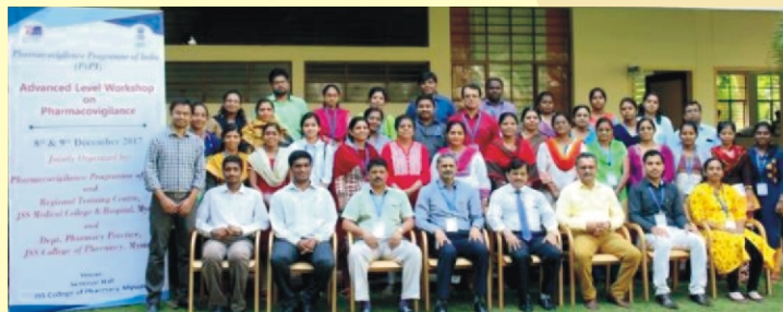
Workshop participants with speakers and coordinators

attended this workshop. Pharmacovigilance experts from JSS College of Pharmacy, JSS Medical College & Hospital and JSS Dental College & Hospital, Mysuru, were the resource persons.