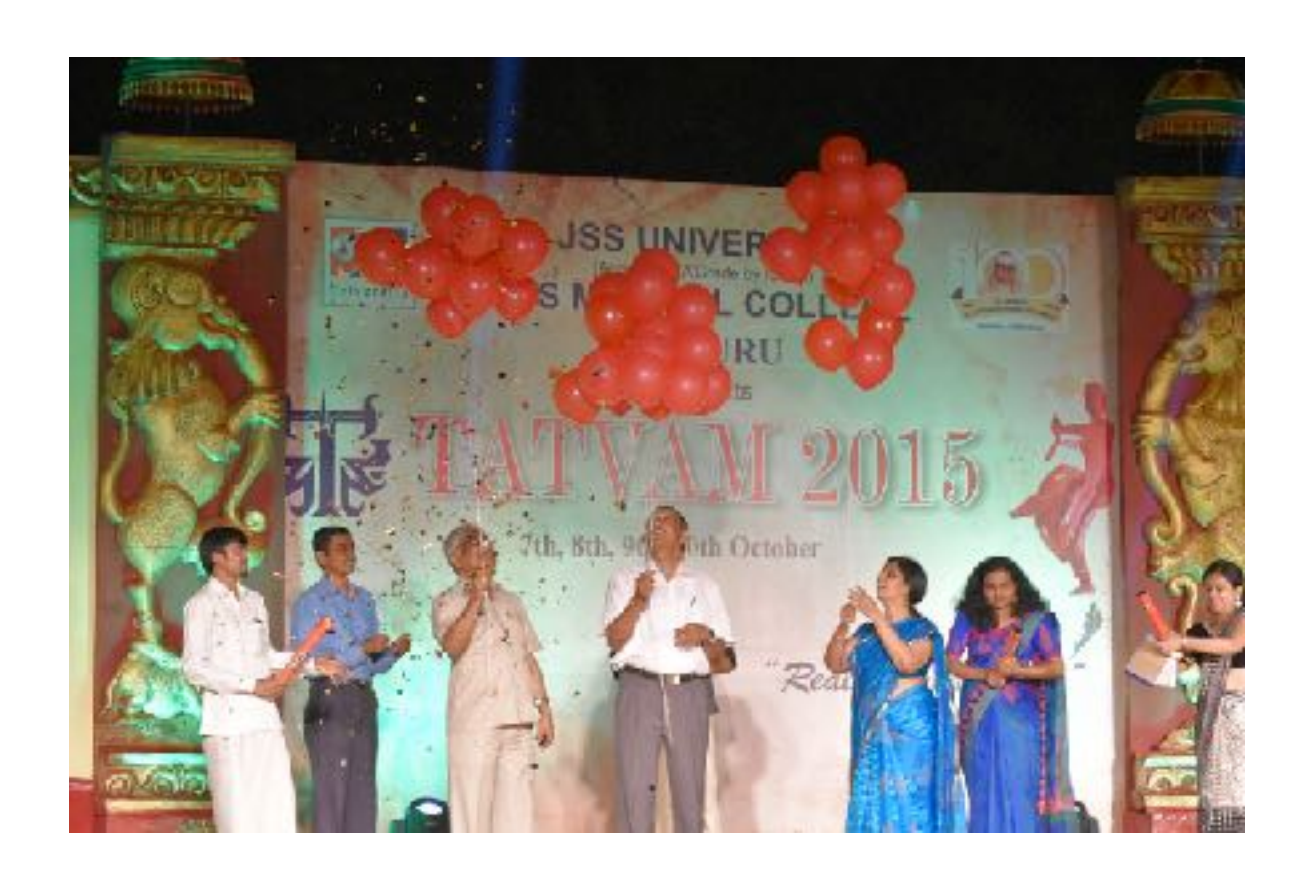
Inauguration of TATVAM, 2015.