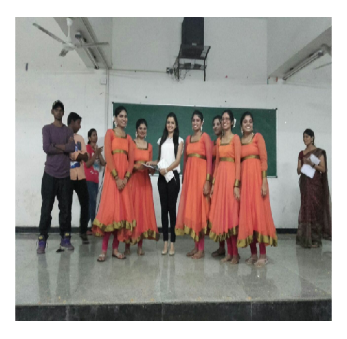
JSSMC DANCE TEAM "THE DANCING DIVAS" at MIMS SAMMSCRITHI - 2015