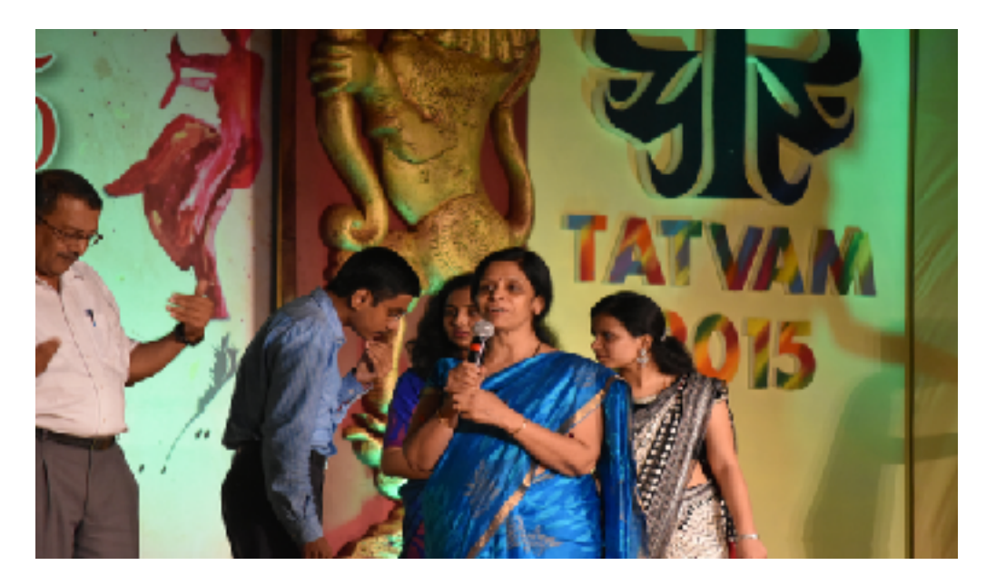
Cultural committee head welcoming the gathering .