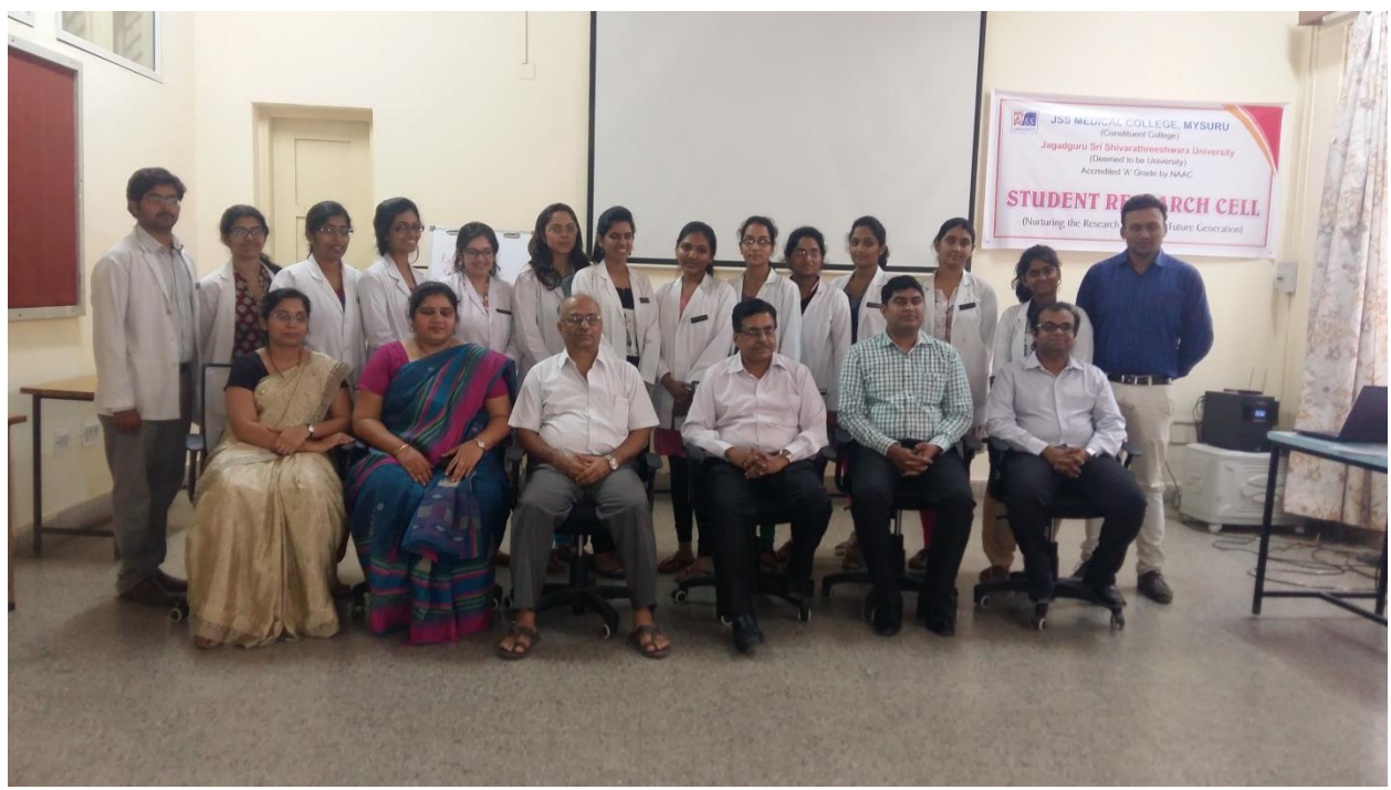
Group Photo of participants and resource faculty