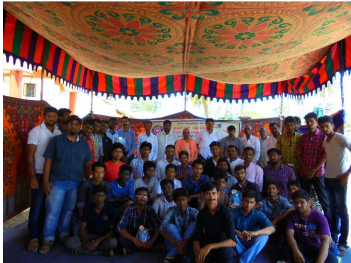
All the NSS Volunteers along with the guests after the Valedictory function