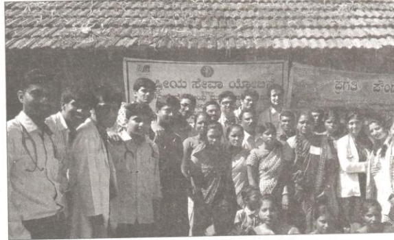
ಜೆಎಸ್ಎಸ್ ವೈದ್ಯಕೀಯ ಮಹಾವಿದ್ಯಾಲಯದ ರಾಷ್ಟ್ರೀಯ ಸೇವಾ ಯೋಜನೆ ಮತ್ತು ಶ್ರೀ ಸಾಯಿ ಪ್ರಗತಿ ಫೌಂಡೇಷನ್ ವತಿಯಿಂದ ಜಾಮರಾಜನಗರ ಜಿಲ್ಲೆಯ ಗುಂಜುಪೇಟೆ ತಾಲ್ಲೂಕಿನ ಮದ್ದೂರು ಗಿರಿಜನ ಕಾಲೋನಿಯಲ್ಲಿ 'ಉಚಿತ ಆರೋಗ್ಯ ತಪಾಸಣಾ ಶಿಬಿರ' ನಡೆಯಿತು.