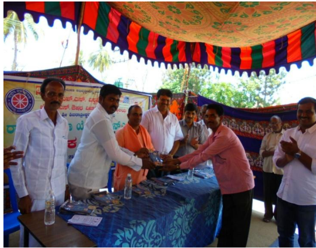
Gram Panchayath President of Benakanahalli village felicitated during the valedictory function