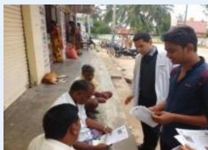
Fig: Educating local public and distributing leaflets.