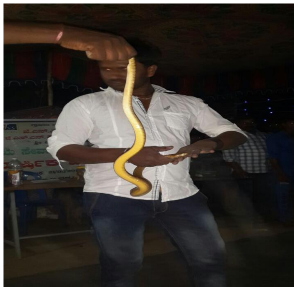
Demonstration of Snakes and educating the villagers