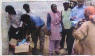
JSS Medical College NSS volunteers distributing medicines.

Protein energy malnutrition, anaemia, scabies, fungal infections of the skin, dental caries, cataract were commonly seen