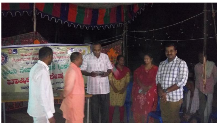
Awareness program on “Underground Water Conservation and safe Use of Water”