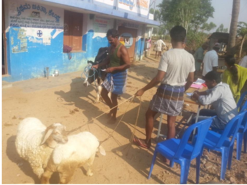
Veterinary Check-up Camp