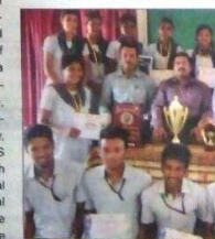
The prize winners are seen with other staff

Mysuru, Oct. 2- The following students of Vijaya Vittala Composite PU College, Saraswathipuram, excelled in various events of "Citizen's Fest," the district-level Intercollegiate competitions organised by Citizens' College of Nanjangud recently.