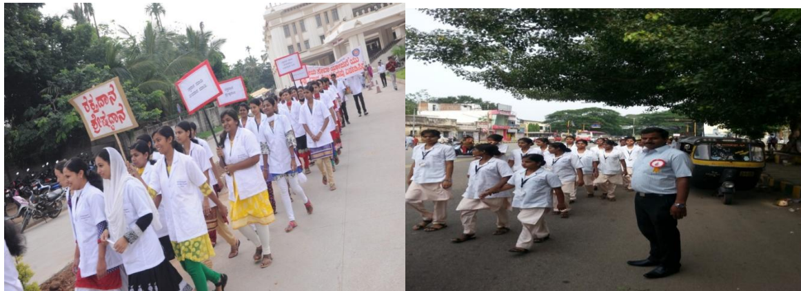
NSS Volunteers participated in World Blood Donors Day – 2015 Awareness rally

On 15 th June 2015 World blood Donors day was Organized and conducted. NSS Unit of JSS College of Pharmacy, Mysore, NSS Unit of JSS College of Nursing & Dept of Transfusion Medicine, JSS Hospital Organized Blood donation Awareness Rally in Collaboration with District Health and Family Welfare, District AIDS Prevention and control unit, Mysuru. More than 500 NSS Volunteers from JSS College of Nursing, JSS Pharmacy College, Mysuru and various other colleges and NGOs Participated in the Rally.