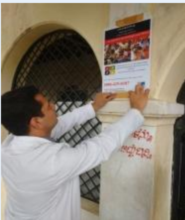
Fig: Display of poster in the Primary healthcare center of Suttur village