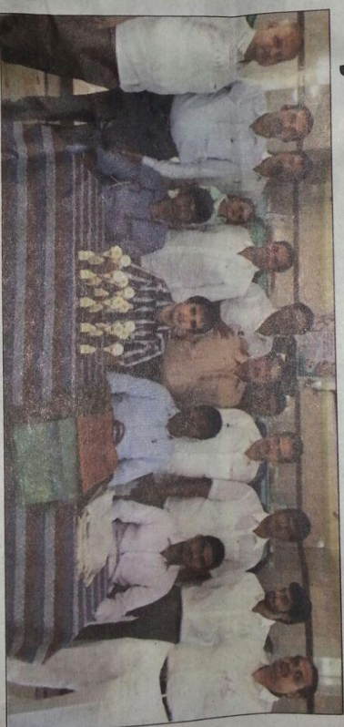
A group photo of the JSS Medical College NSS team which visited the flood-hit TN.

Mysuru, Dec.22- The NSS Unit of JSS Medical College, Mysuru, has lent a helping hand to the victims of floods in Tamil Nadu by providing medical aid to them.