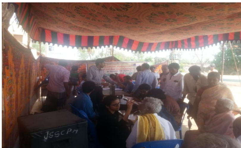
Benakanahalli villagers were diagnosed and treated by Ophthalmologists, Orthopaedicians and Dermatologists of JSS Medical College and Hospital, Mysuru.