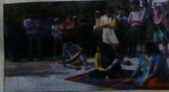
NSS volunteers staging street play