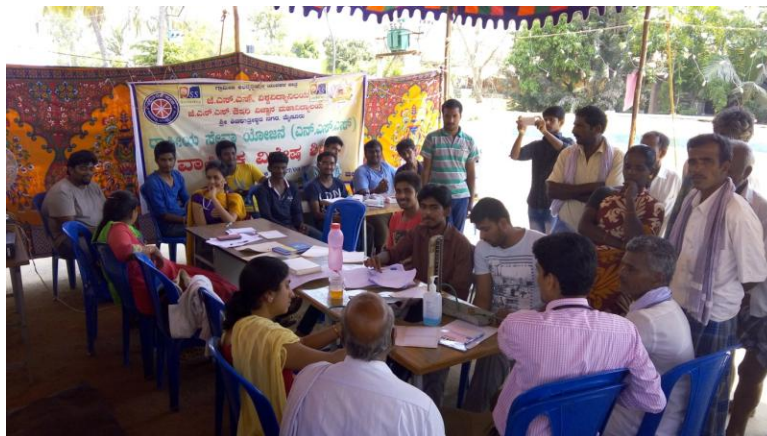
Free Medical check-up camp by JSS Medical College and Hospital, Mysuru.