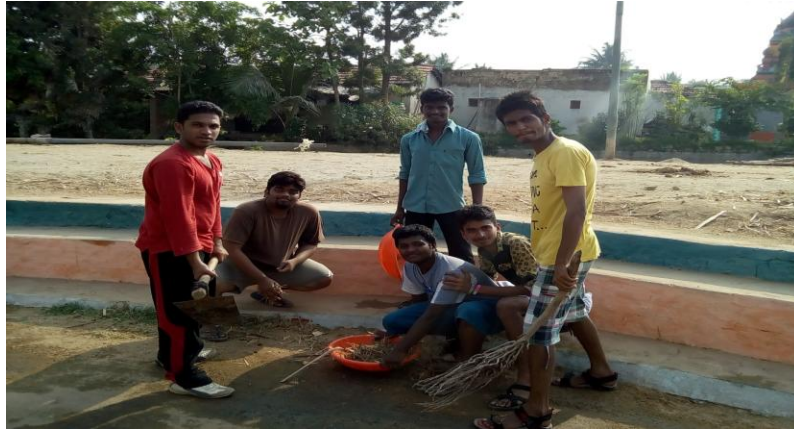
Shramadhana by NSS volunteers

World Water's Day 2016 celebration by organizing and conducting a Rally and creating awareness among the Benakanahalli villagers