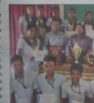
The prize winners are seen with other staff

Mysuru, Oct. 2: The following students of Vijaya Vittala Composite PU College, Sarawathipuram, excelled in various events of "Citizen's Fest," the district-level intercollegiate competitions organised by Citizens' College of Nanjangud recently.