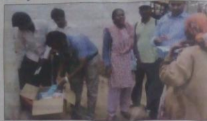
JSS Medical College NSS volunteers distributing medicines.

Protein energy malnutrition, anaemia, scabies, fungal infections of the skin, dental caries, cataract were commonly seen