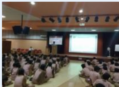
Fig: Educating the Students of JSS High School about First Aid Measures.