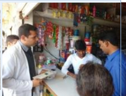
Fig: Educating the local Community Pharmacists about the Poison Information Services and safe use of medications to prevent poisoning due to medications.