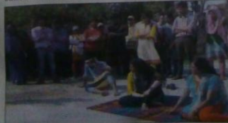
NSS volunteers staging street play